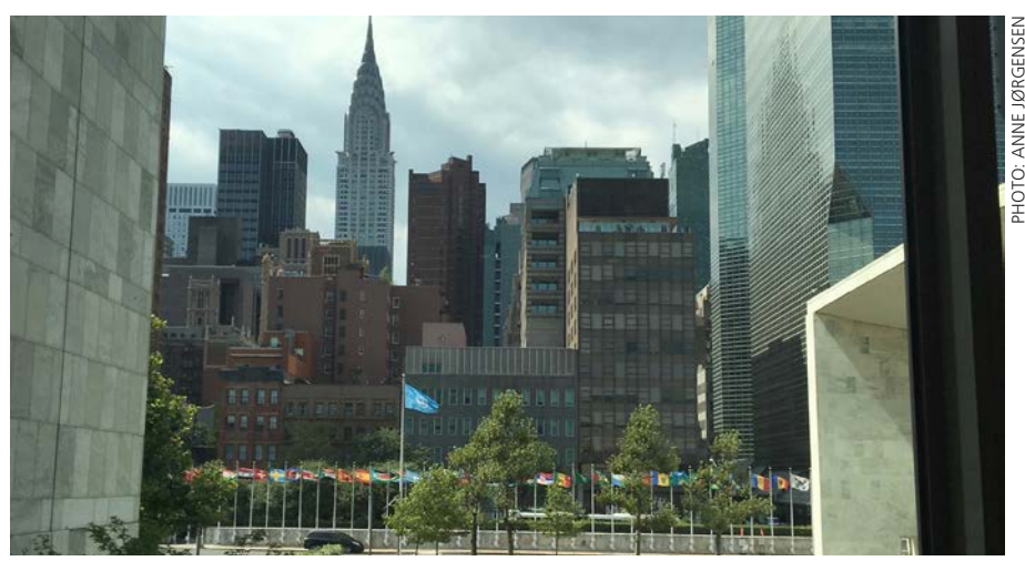
NEW YORK: The establishment of the new UN-GGIM subcommittee on geodesy provides stability and longer-term planning for the GGRF.

The arrangement of the inaugural formal workshop of the subcommittee is tentatively planned in the margins of the 2017 UN-GGIM High Level Forum in Mexico City.